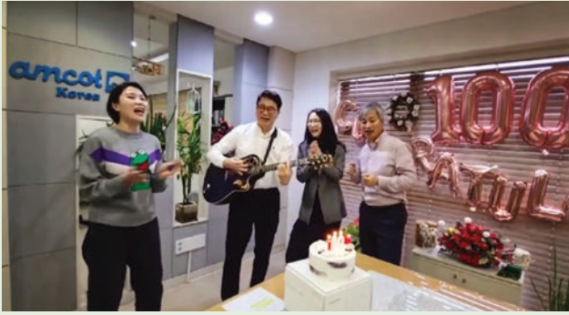
The team from Amcot Korea played a delightful song in a video to congratulate Staplcoth on their anniversary.