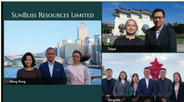
Congratulatory videos were sent from SunBliss Resources Limited as well as many other business partners from abroad.