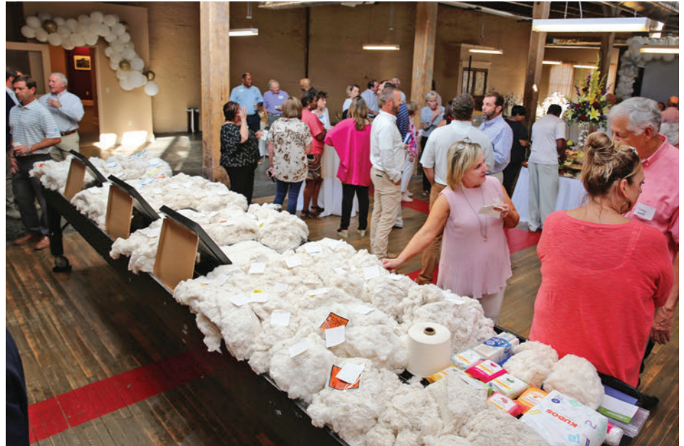
The Greenwood Leflore Chamber of Commerce sponsored Business After Hours in July, which was held in Staplcotn's Multipurpose Room to spotlight the company's 100-year milestone.